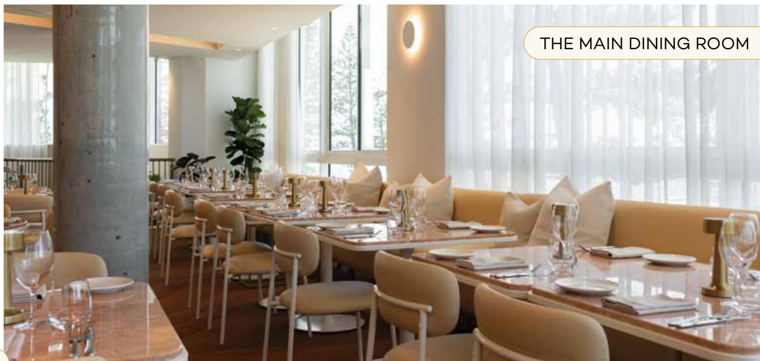
THE MAIN DINING ROOM