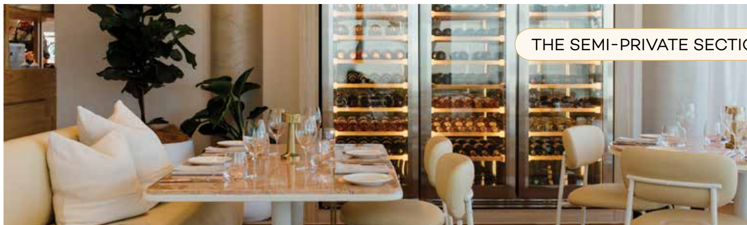
THE SEMI-PRIVATE SECTION