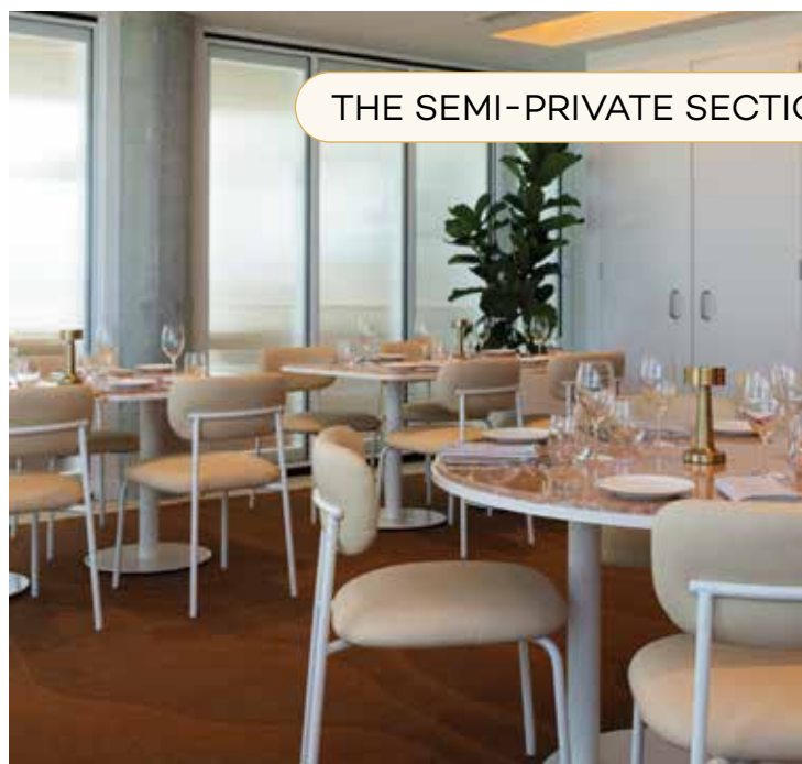
THE SEMI-PRIVATE SECTION